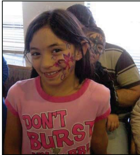
A Dental Aid participant is all "smiles" after receiving care. The Youth Advisory Committee gave a grant to help children receive dental screenings

The Youth Advisory Committee has also awarded grants to help Broomfield youth. Recent examples include Broomstock, Broomfield Summer Youth Players, the BATL (Brave and Active Teens) program at Legacy High School and help with dental screenings