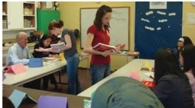
Volunteer teachers work with English language learners in a recent class hosted by English Language Link.

The Broomfield Community Foundation recently provided a grant to English Language Link so that they will be able to offer increased services to non-English speaking Broomfield residents. The program improves community literacy, helps parents take a more active role in their child's education